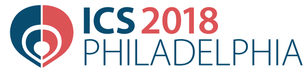
ICS 2018 Dark two colour logo