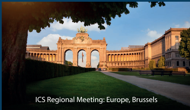
ICS Regional Meeting: Europe, Brussels

Visit www.ics.org/regional for more information