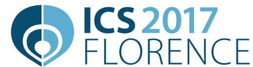
ICS 2017 Dark two colour logo