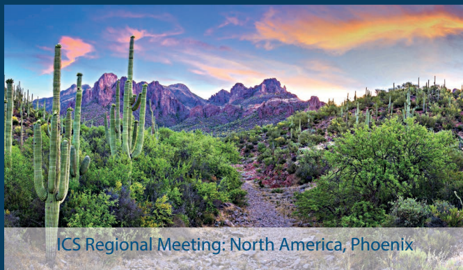
ICS Regional Meeting: North America, Phoenix