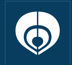
Single colour ICS emblem