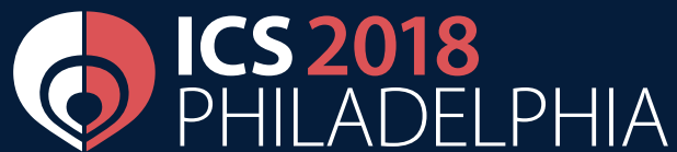
ICS 2018 Standard two colour logo