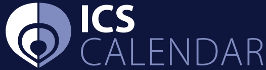
ICS Calendar Standard two colour logo

Visit www.ics.org/calendar for more information