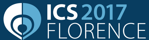
ICS 2017 Standard two colour logo